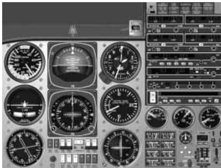
Figure I.9 Photorealistic Piper Seneca III Module: the interface for a flight simulator. © 1998 Initiative Computing AG, Switzerland. Reprinted with permission.

Introduction: The Double Logic of Remediation