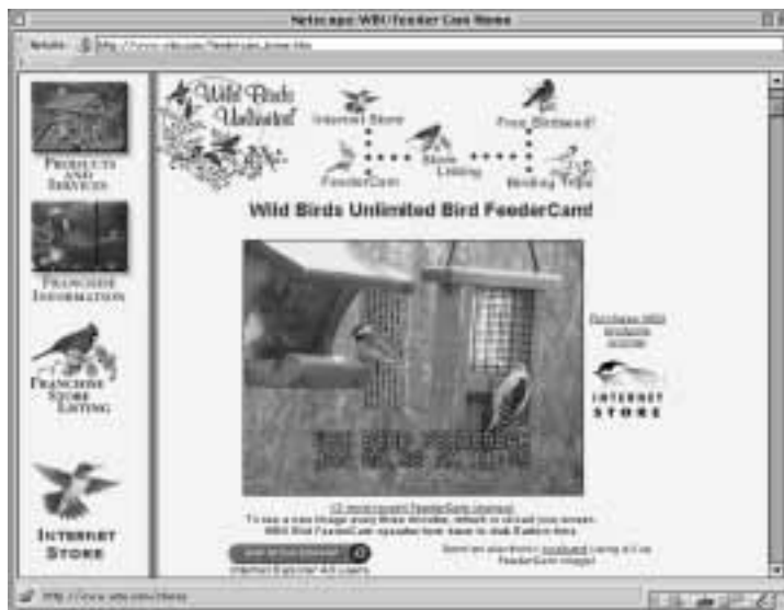
Figure I.2 Bird feeder webcam: the view is updated every three minutes. http://www.wbu.com/feederCam_home.htm January 24, 1998.

In this last decade of the twentieth century, we are in an unusual position to appreciate remediation, because of the rapid development of new digital media and the nearly as rapid response by traditional media. Older electronic and print media are seeking to reaffirm their status within our culture as digital media challenge that status. Both new and old media are invoking the twin logics of immediacy and hypermediacy in their efforts to remake themselves and each other. To fulfill our apparently insatiable desire for immediacy, “live” point-of-view television programs show viewers what it is like to accompany a police officer on a dangerous raid or to be a skydiver or a race car driver hurtling through space. Filmmakers routinely spend tens of millions of dollars to film on location or to recreate period costumes and places in order to make their viewers feel as if they were “really” there. “Webcams” on the Internet pretend to locate us in various natural environments—from a backyard bird feeder in Indianapolis (Fig. I.2) to a panorama in the Canadian Rockies (Fig. I.3). In all these cases, the logic