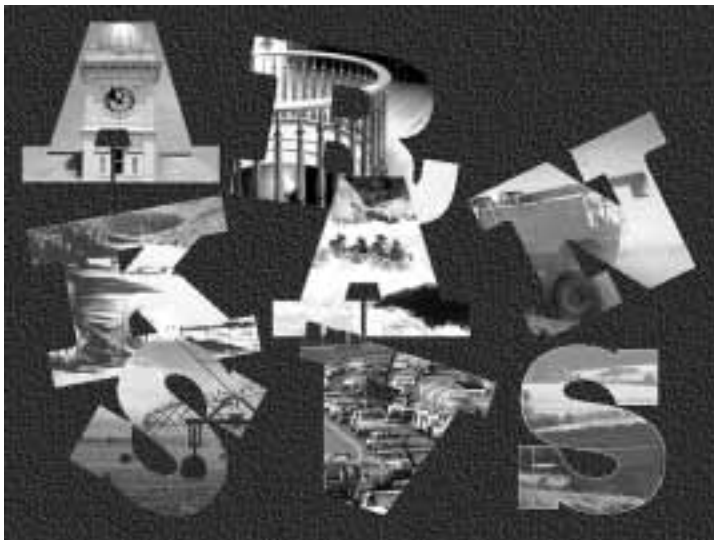
Figure I.13 Arkansas: the splash (opening) screen for a multimedia celebration of the state.