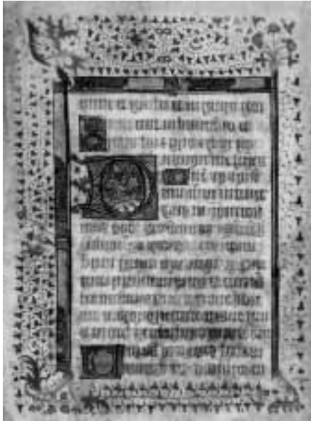
Figure I.12 A page from a Book of Hours, circa 1450. © Robert W. Woodruff Library, Emory University. Used by permission.