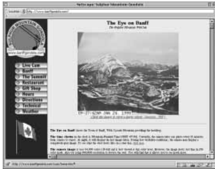
Figure I.3 Sulphur Mountain webcam, providing a repeatedly updated view of a mountain in the Canadian Rockies in Banff, Alberta. http://www.banffgondola.com/ January 24, 1998. © 1998, Sulphur Mountain Gondola. All rights reserved. Used by permission.

of immediacy dictates that the medium itself should disappear and leave us in the presence of the thing represented: sitting in the race car or standing on a mountaintop.