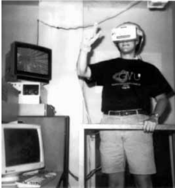
Figure I.1 A virtual reality head-mounted display.

“not TV only better,” the film ends up representing the wire as “film only better.” When Lenny himself puts on the wire and closes his eyes, he experiences the world in a continuous, first-person point-of-view shot, which in film criticism is called the “subjective camera.”