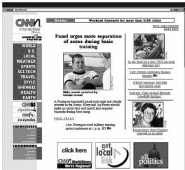
Figure I.7 The CNN Interactive web site.

news producers assemble on the screen ribbons of text, photographs, graphics, and even audio without a video signal when necessary (as was the case during the Persian Gulf War). At the same time, even the most hypermediated productions strive for their own brand of immediacy. Directors of music videos rely on multiple media and elaborate editing to create an immediate and apparently spontaneous style; they take great pains to achieve the sense of “liveness” that characterizes rock music. The desire for immediacy leads digital media to borrow avidly from each other as well as from their analog predecessors such as film, television, and photography. Whenever one medium seems to have convinced viewers of its immediacy, other media try to appropriate that conviction. The CNN site is hypermediated—arranging text, graphics, and video in multiple panes and windows and joining them with numerous hyperlinks; yet the web site borrows its sense of immediacy from the televised CNN newscasts. At the same time televised newscasts are coming to resemble web pages in their hypermediacy (fig. I.7 and I.8). The team of web editors and designers, working in the same building in Atlanta from which the television news networks are also administered, clearly want their technology to be “television only better.” Similarly,