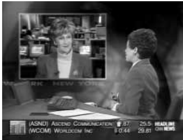
Figure I.8 CNN Headline News.