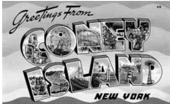
Figure I.14 A Coney Island postcard from the 1910s. http://naid.sppsrl.ucla.edu/coneyisland/histart.htm January 24, 1998.

postcard of Coney Island from the early twentieth-century shows (fig. I.14). Today as in the past, designers of hypermediated forms ask us to take pleasure in the act of mediation, and even our popular culture does take pleasure. Some hypermediated art has been and remains an elite taste, but the elaborate stage productions of many rock stars are among many examples of hypermediated events that appeal to millions.