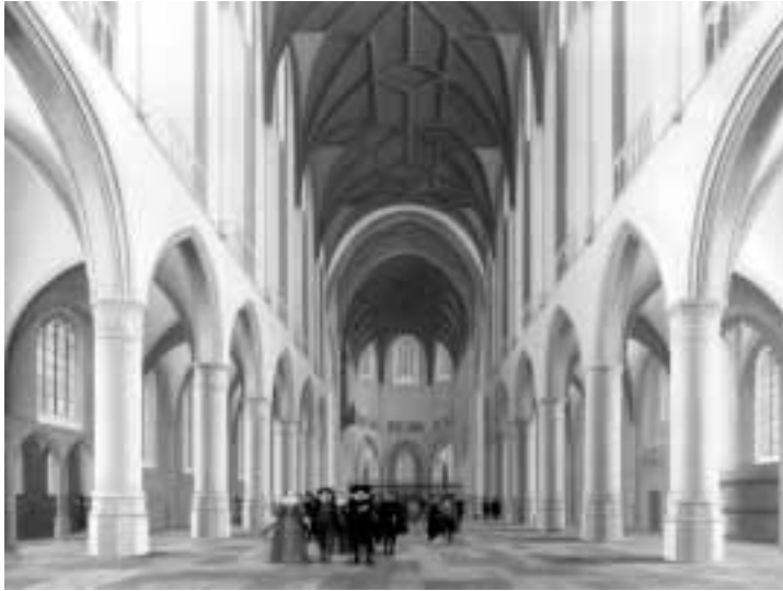
Figure I.10 Saenredam, Pieter Jansz. “S. Bavo in Haarlem” 1631. The John G. Johnson Collection, Philadelphia Museum of Art. Used by permission.

one of the most popular genres of computer games is the flight simulator (fig. I.9). The action unfolds in real time, as the player is required to monitor the instruments and fly the plane. The game promises to show the player “what it is like to be” a pilot, and yet in what does the immediacy of the experience consist? As in a real plane, the simulated cockpit is full of dials to read and switches to flip. As in a real plane, the experience of the game is that of working an interface, so that the immediacy of this experience is pure hypermediacy.