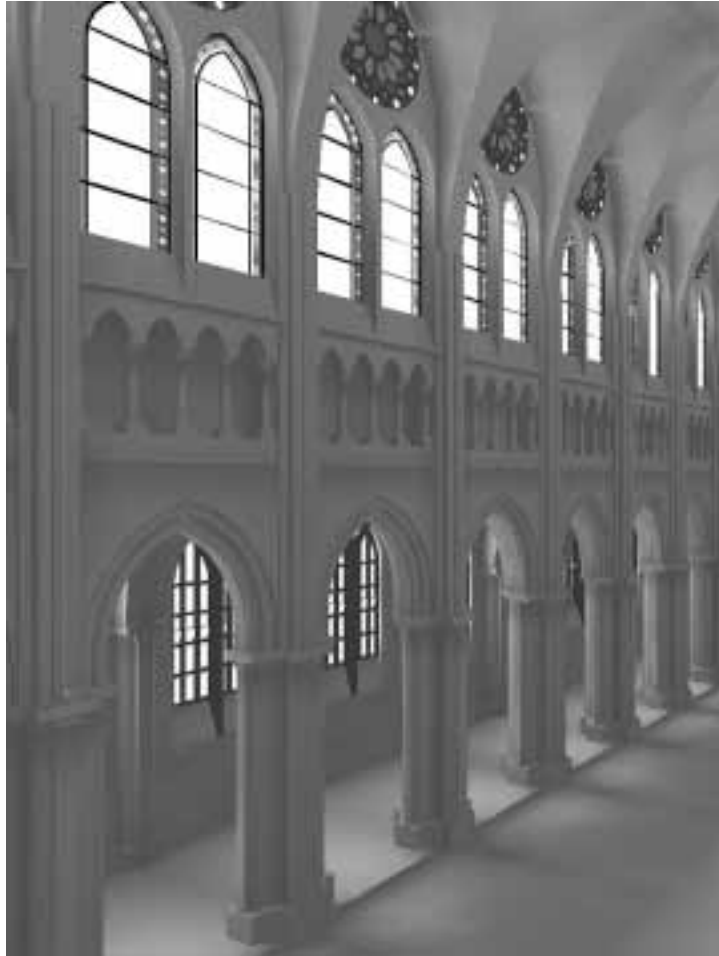
Figure I.11 A photorealistic computer graphic: the nave of Chartres Cathedral, by John Wallace and John Lin.

Like immediacy, hypermediacy also has its history. A medieval illuminated manuscript, a seventeenth-century painting by David Bailly, and a buttoned and windowed multimedia application are all expressions of a fascination with media. In medieval manuscripts, the large initial capital letters may be elaborately decorated, but they still constitute part of the text itself, and we are challenged to appreciate the integration of text and image (fig. I.12; plate 2). In many multimedia applications, icons and graphics perform the same dual role (as in figure I.13; plate 3), in which the images peek out at us through the word ARKANSAS. This dual role has a history in popular graphic design, as a